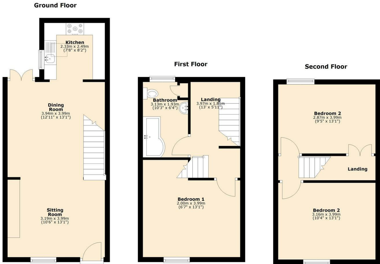
2 Myrtle Cottages, Ingleton